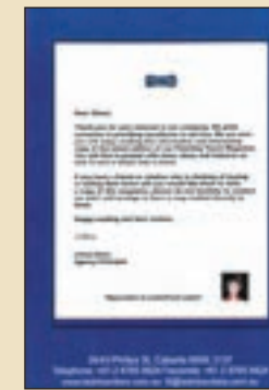
The inside front cover to profile and present you agency.