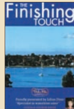
Provide us with a cover or choose from one of our existing high image covers