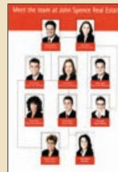
The inside back cover can introduce your service and your team.